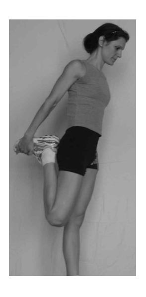
STRETCH for 30 seconds to 3 minutes each: quads, calves, & hip flexors